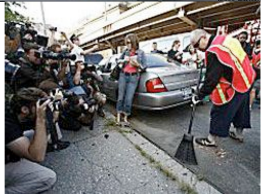
... this is now!